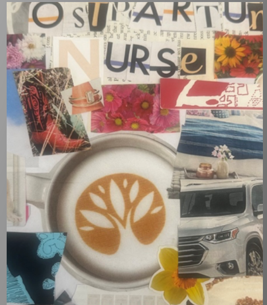
“Vision board” detailing one student’s dream of becoming a postpartum nurse